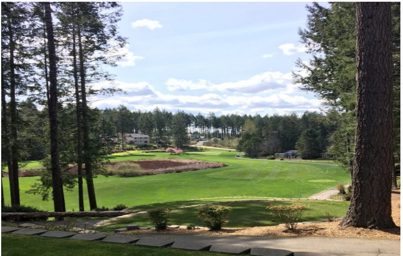
The 6th Hole at LLCC

I hope you are having a great summer. We will see you on the golf course or walking/cart path.