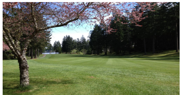
8th Fairway at LLCC