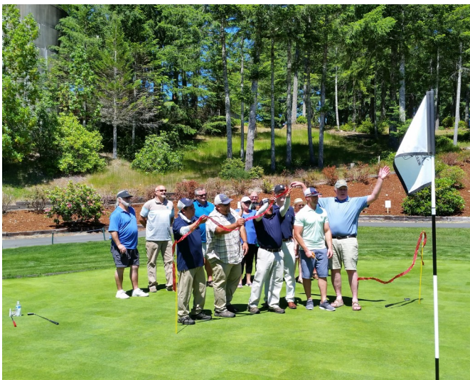
Hole #7 Opening Ceremony June 12, 2019

Families are enjoying our Parks and Lakes with boating, fishing and swimming playing in the sun. If you haven't visited our Parks this season, they are calling out to enjoy the maintained grounds, docks, swimming, fishing and picnic opportunities at Way to Tipperary, Log Toy, Banbury, Anglia, Inn grounds & Island, Lake Leprechaun and Olde Lyme. Olde Lyme is currently undergoing a significant development with improved trail access to Cranberry Creek and planned playground and picnic table areas. We look forward to your feedback on our 7 Parks.