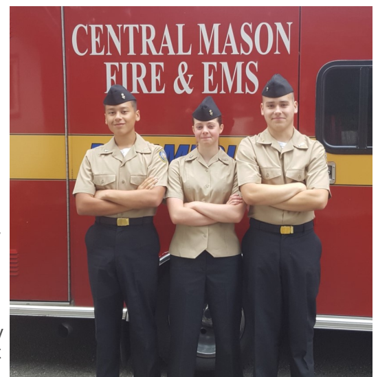
Shelton High School Junior ROTC Getting Ready to Kick off the LL Daze Parade

Closest to the hole and putting contests sponsored by our golf clubs provided opportunities to improve one's skill as well as win prizes and help raise funds. The Magpies ran a bake sale and sold hot food and strawberry shortcakes out of our freshly repainted snack shack that were all a sold out success. Annual volleyball tournament held lakeside during the afternoon saw prizes awarded for the winners and runner up teams. A brand new bouncy house made its debut in an expanded effort on children's activities. The little ones were delighted with options that included rock painting, bubble machines, temporary tattoos and the bouncy house. The days events stretched from a early morning pancake breakfast offered by our community fire station to a dusk boat parade around the lake.